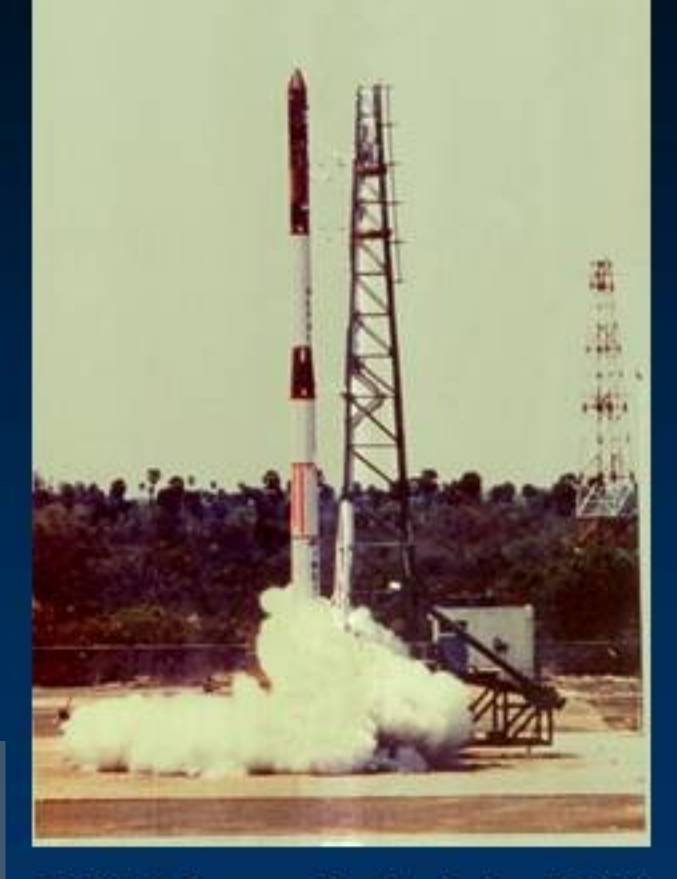
SLV-3 Launch 18 July 1980