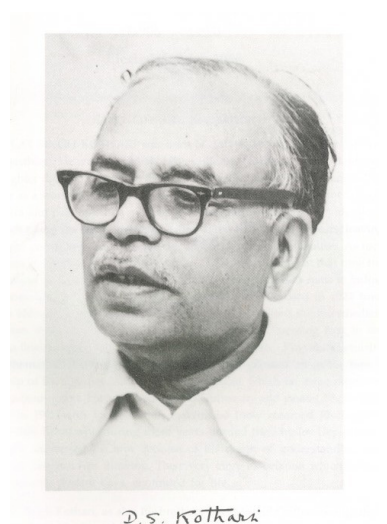
Outstanding Physicist and also an Astrophysicist